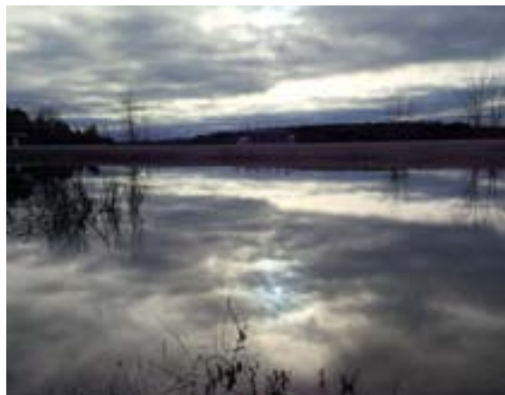
First trip to Belwood Lake for the season. The lake was reflecting the weak spring sun. The water is clear and the geese were flying over. Almost time to get the boats in the water. Photo by Frances Norlen who wins the prize for being the first on the lake for 2016

This is the day we look forward to all winter!! Come to help with putting the